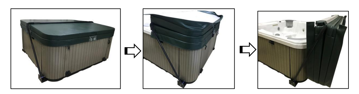
Note - if installed with the undermount bracket or direct to a conductive surface (including undermount bracket sitting on concrete under the spa), this cover lifter must be earth bonded by your electrician.