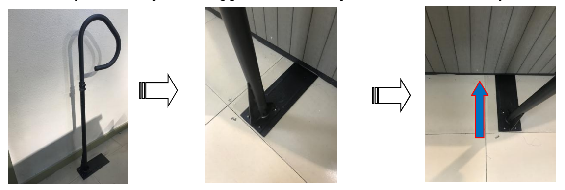
Note - if installed with the undermount bracket or direct to a conductive surface (including undermount bracket sitting on concrete under the spa), this cover lifter must be earth bonded by your electrician.

STEP4, Slide the base plate under the spa in your desired position, and then you can adjust the upper rail with adjustable button when you use it.